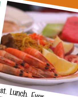
Best. Lunch. Ever.