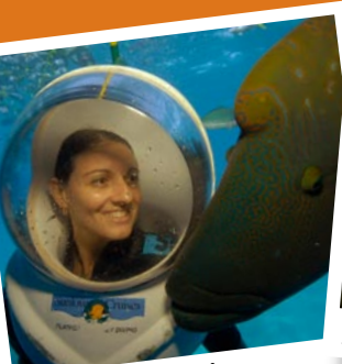
Meet new friends

Terms and Conditions: Prices are current at the time of printing and subject to change. Valid for full fare paying adults. August departures only. Valid to 31 August 2008.