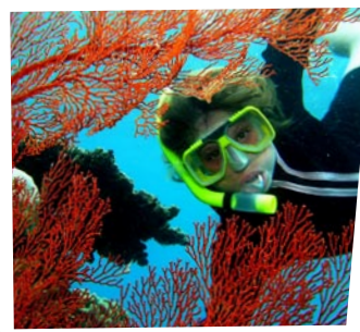
One of the seven wonders!